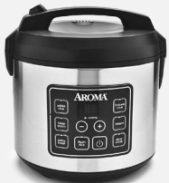
Multicookers/ Rice Cookers