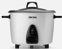
Pot-Style Rice Cookers